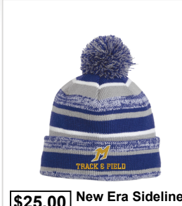
$25.00 New Era Sideline Beanie