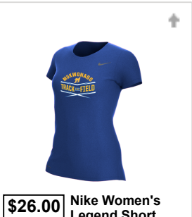
Legend Short Sleeve T-Shirt