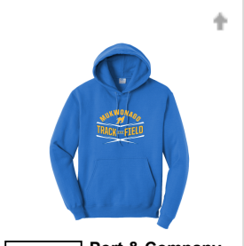
$39.00 Port & Company Ultimate Pullover Hooded Sweatshirt