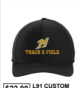
$22.00 L91 CUSTOM TECH CAP